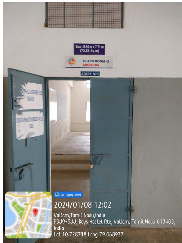
ARCH 104 – Class Room