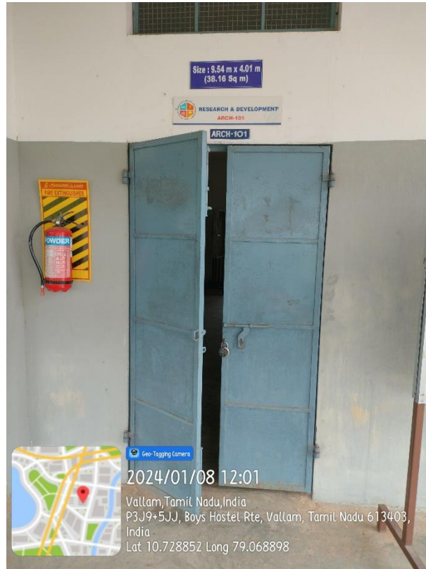
ARCH 101 - Class Room