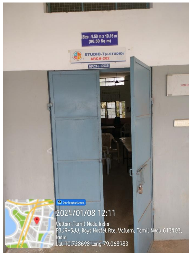
ARCH 202 - Studio 7