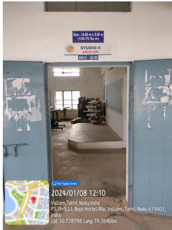
ARCH 206 - Studio 5