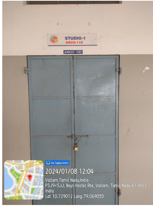
ARCH 110 - Studio 1