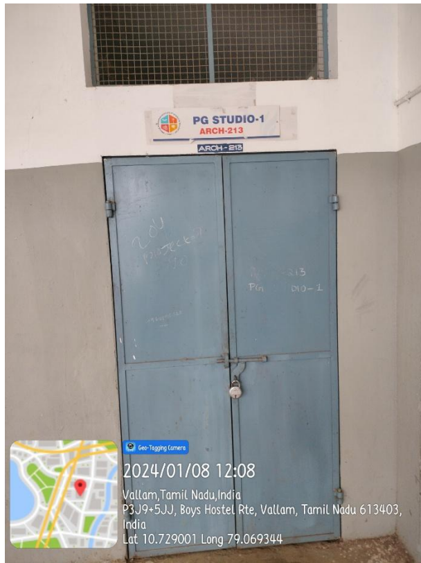
ARCH 213 – Studio 1