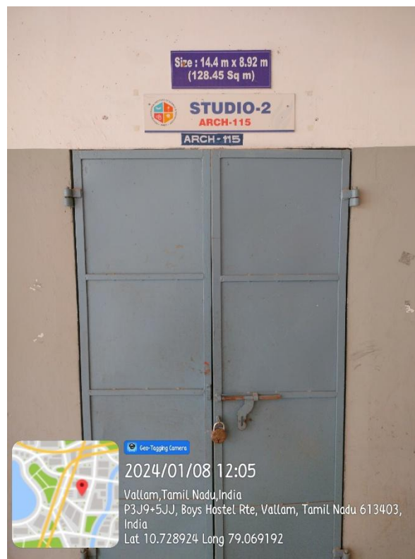
ARCH 115 - Studio 2