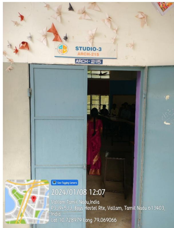
ARCH 215 - Studio 3