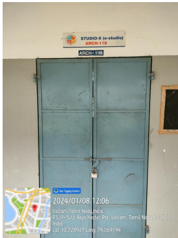
ARCH 118 - Studio 9