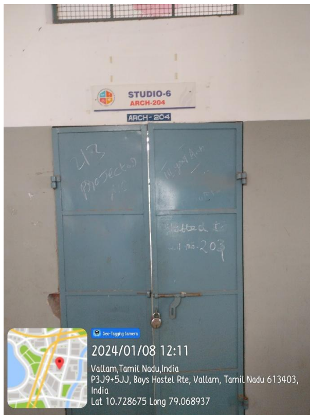
ARCH 204 - Studio 6