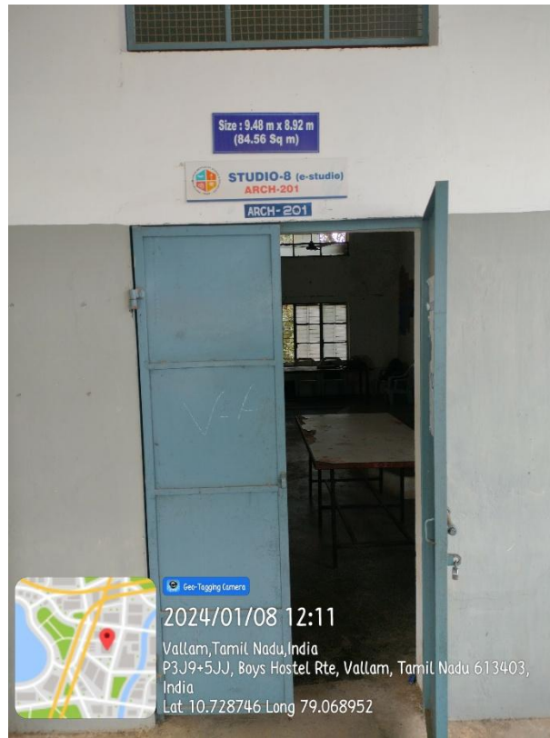
ARCH 201 - Studio 8