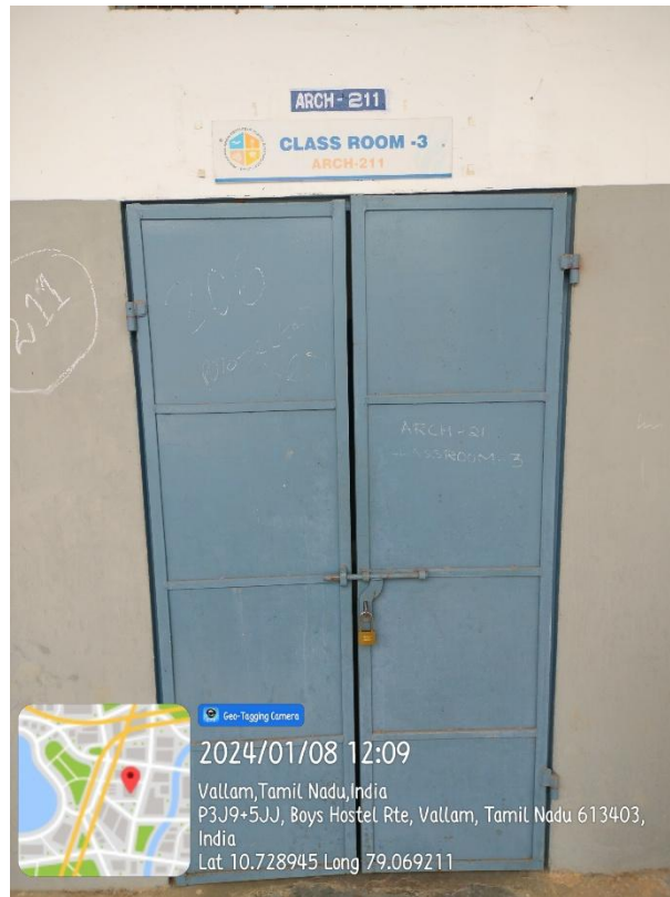
ARCH 211- Class Room