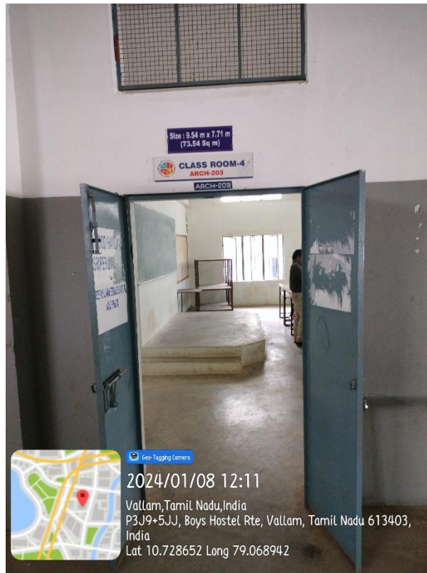
ARCH 203 – Class Room