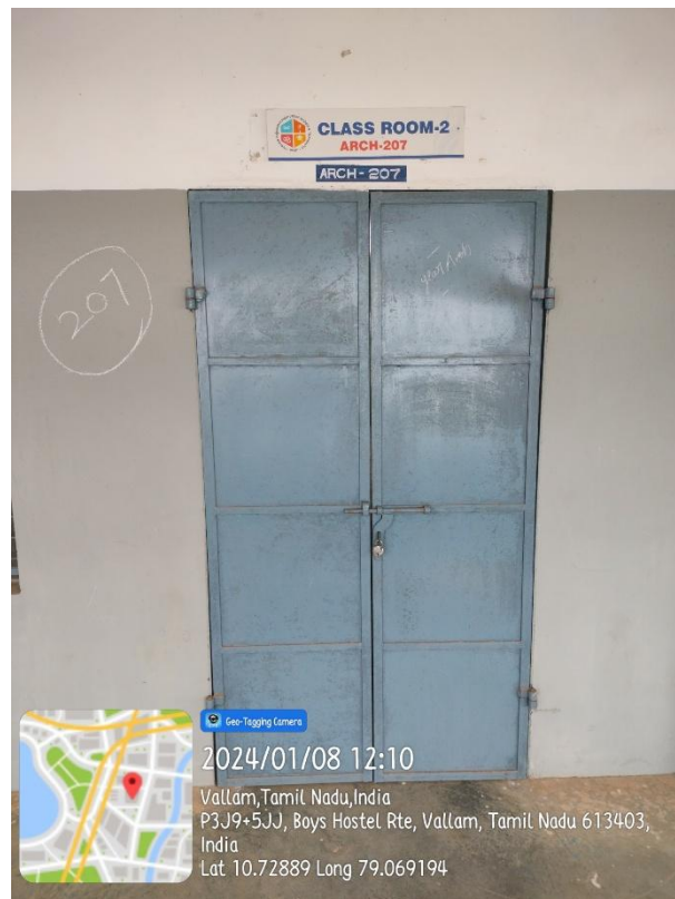
ARCH 207 – Class Room